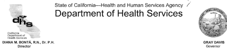
Figure J-1. Response Letter from the Department of Health Services

Requests for groundwater well information were requested from a number of agencies and municipal water companies, including the California Department of Health Services (DHS), Ventura Water Works District No. 8 (VWWD), the Central Coast Regional Water Quality Control Board, Los Angeles County Department of Public Works, the Los Angeles Department of Power and Water (LADPW), Southern CA Water Company, and the California Department of Water Resources. Groundwater monitoring results and well histories were requested for wells within 3 miles of SSFL. Information was obtained from VWWD and LADPW, but it was either out of date or incomplete. Personnel from VWWD were reluctant to reply to requests from the study team. Information was subsequently requested again and partial information was obtained later under an assumed identity. However, requests to make photocopies of VWWD well histories and monitoring data were denied; it was claimed that well-related info was confidential. The request for source water information from the California DHS was also denied as documented in the reply letter from DHS below (Figure J-1).